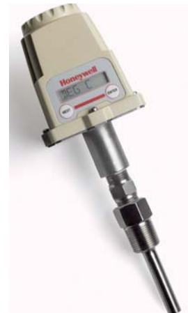
XYR 5000 Wireless Temperature Transmitter