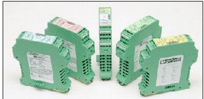
Figure 1. Analog and digital I/O expansion modules