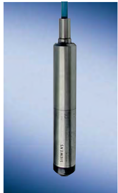
The MPS series

The SITRANS P, MPS series is a transmitter for hydrostatic level measurement. It's dipped into the medium hanging at the end of a cable. The sensor's stainless steel housing makes it suitable for use in everything from drinking water to aggressive liquids.