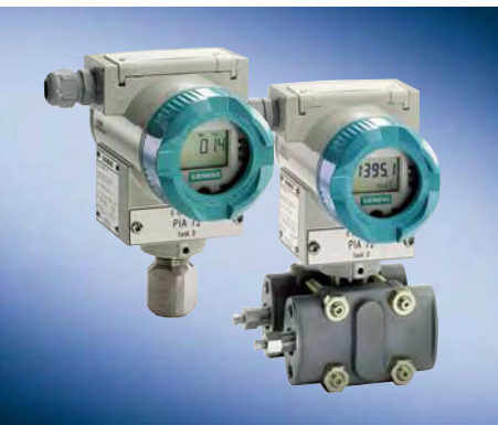
The DS III series

The SITRANS P DS III transmitter features a special safety standard for pressure, differential pressure, absolute pressure and fill level. The transmitter is suitable for use in SIL 2 measurement loops according to IEC 61508/IEC 61511. Safety-related functions include automatic error diagnostics, defined error handling as well as calculation of the error rate.