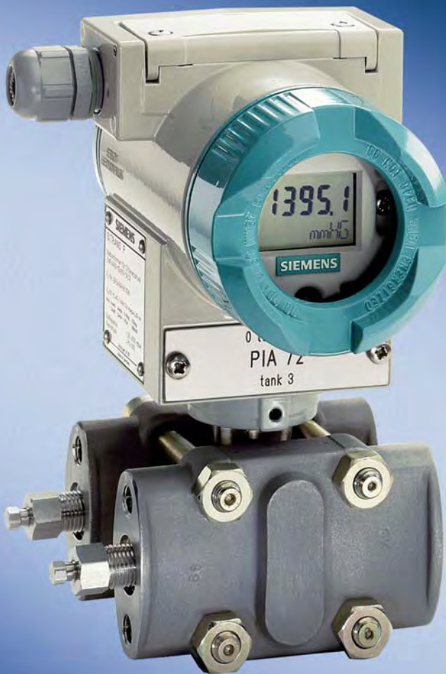
The DS III series