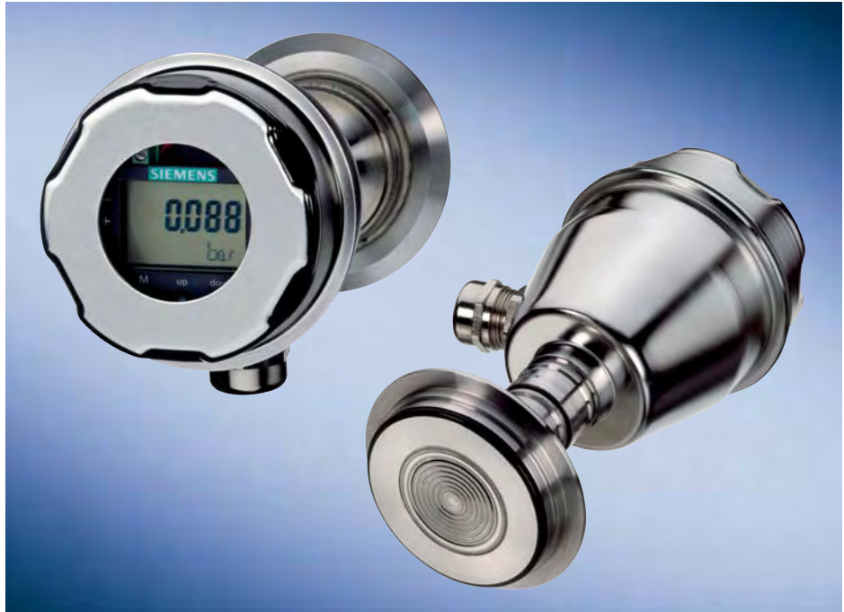
The P300 series

It is also worth mentioning the optional extended temperature range up to 392 °F/ 200 °C, which allows the transmitters to be used in applications for which remote seals had to be used in the past. This is where the SITRANS P300 stands out thanks to its increased accuracy of measurement and shorter delivery times as compared to remote seals.