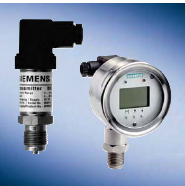
The Z and ZD series

In the Z series, we use two types of diaphragm materials: stainless steel or ceramic. That makes measuring process pressure, absolute pressure and hydrostatic pressure a breeze. You can set the pressure measured with these sensors to be transformed into either a 4–20 mA or 0–10 V signal.