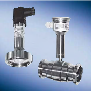
The Compact series

The SITRANS P Compact is an analog transmitter for measuring absolute and gage pressure. It was developed with the special requirements of the food-and-beverage/pharmaceuticals/biotechnology industries in mind. The devices are designed to meet the hygienic recommendations of EHEDG, FDA and GMP. A number of aseptic process connections made of stainless steel and a stainless steel housing (IP67) were included in the Compact series to meet the more stringent hygienic requirements. High surface quality was a special focus, with an option to electropolish the system. Our pressure measurement specialist "Compact" complements its cleaning and sterilization process (CIP, SIP) with no-drift, error-free functionality.